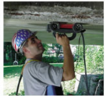
This image shows the deteriorated concrete on the beams and the corroded pre-stressing steel. This is where the composite was to be added.

our schedule which often required them to start very early or late in the normal work day. All of the diaphragms were located within the tolerances required and to the satisfaction of the owner. Fort Defiance would not hesitate to use GPRS for any of our future projects, no matter how complicated they may be."