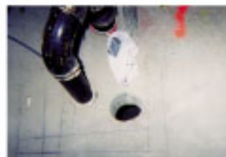
The mechanical contractor is able to drill the hole by staying away from marks which represent cables.

This technology allows the contractor to precisely locate reinforcing, electrical conduit, water and sewer lines and voids in and below a concrete slab. The radar is much safer than x-rays and can be done in structures without disturbing the occupants.